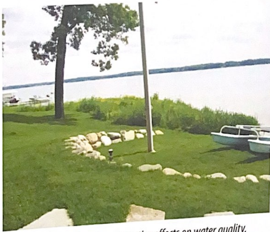
Phosphorus runoff can have negative effects on water quality, fisheries and recreation. A vegetative buffer, as seen above, is one way to reduce these effects.

Phosphorus is a naturally occurring essential nutrient for plant and animal growth. It is also a primary water quality concern in Michigan. When excess phosphorus is applied on land, it may run into nearby lakes, rivers and streams. This runoff can lead to increased algae and aquatic plant growth which can have negative effects on water quality, fisheries, recreation, and property values. By restricting unnecessary phosphorus applications, the phosphorus law will help maintain and protect Michigan's vast water resources.