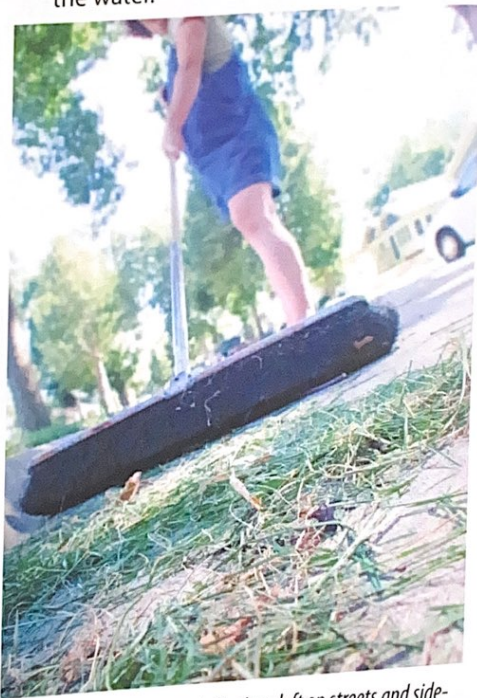
Sweep it up! Fertilizer and clippings left on streets and sidewalks can be a major contributor to phosphorus loads in lakes and rivers.

Additional Information Be Phosphorus Smart!